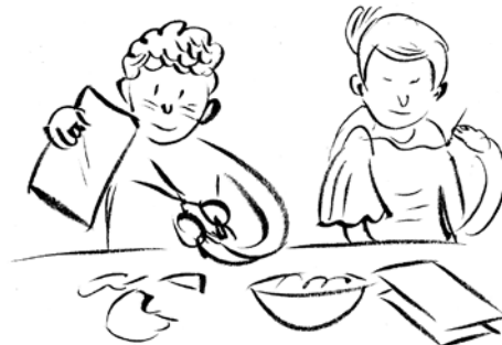
Arts and crafts projects