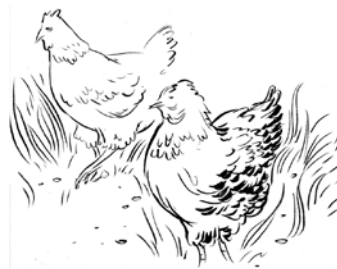
The Farm Set

There was a swing set. Both Pipe and the rooster took rides on swings. The rooster went down the slide.