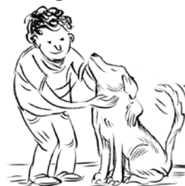
Be kind to animals