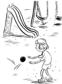
The Playground Set

The filmmaker uses several different settings for this film. Discuss the different settings with children. Ask them to describe one of the sets. Examples: