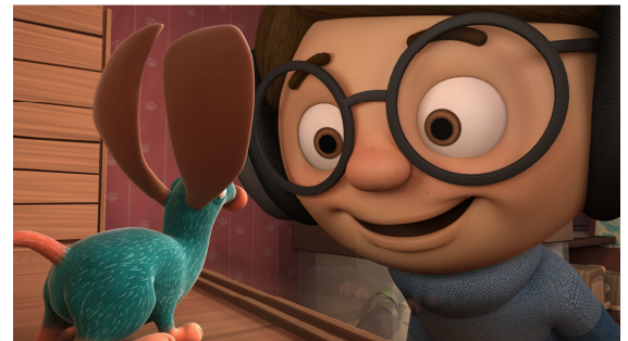
Pictured: Mouse for Sale

Films from Belgium, Canada, Germany, Sweden, Switzerland and the US!