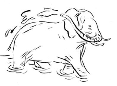
One day, a huge elephant sprayed wet mud everywhere.