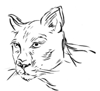
Long ago, leopards looked just like mountain lions.

FIND OUT MORE! Investigate with research